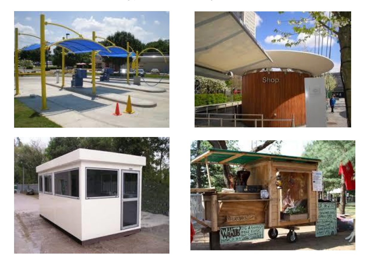
Figure 3. Examples of canopies and kiosks.

Figure 3 shows some examples of canopies and kiosks that can be found in cities, including different materials, manufacturing processes and designs.