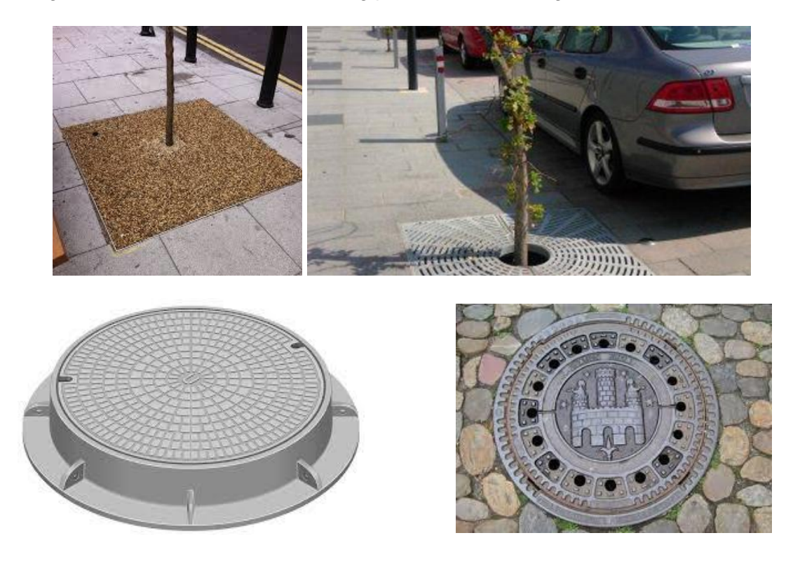
Figure 8. Examples of tree pits, manholes and lids.

Figure 8 shows some examples of tree pits, manholes and lids that can be found in cities, including different materials, manufacturing processes and designs.