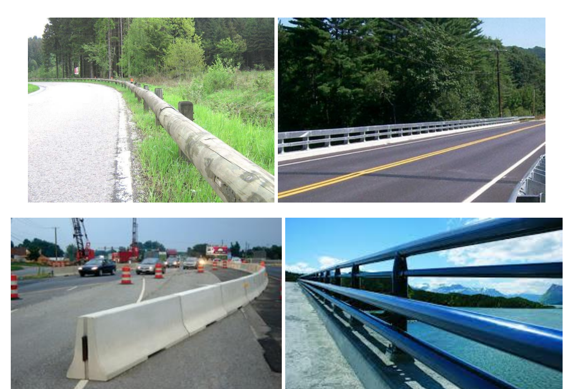
Figure 13. Examples of guardrails, barriers and parapets.

Figure 13 shows some examples of guardrails, barriers and parapets that can be found in cities, including different materials, manufacturing processes and designs.