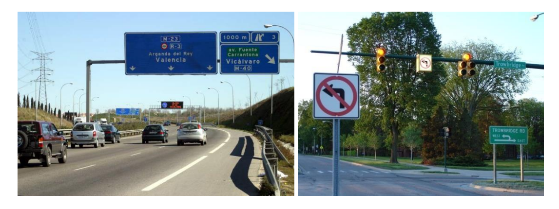
Figure 12. Examples of traffic signs.

Figure 12 shows some examples of traffic signs that can be found in cities, including different materials, manufacturing processes and designs.