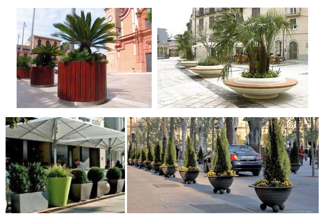
Figure 7. Examples of planters and pots.

Figure 7 shows some examples of planters and pots that can be found in cities, including different materials, manufacturing processes and designs.