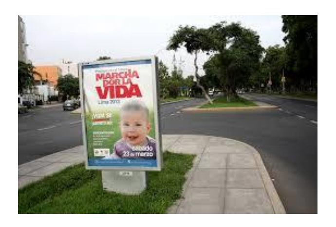
Figure 6 shows some examples of advertising and information panels that can be found in cities, including different materials, manufacturing processes and designs.