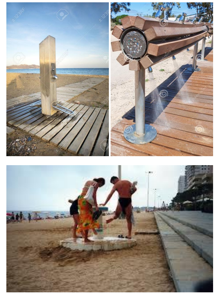
Figure 11. Examples of showers and footbaths.