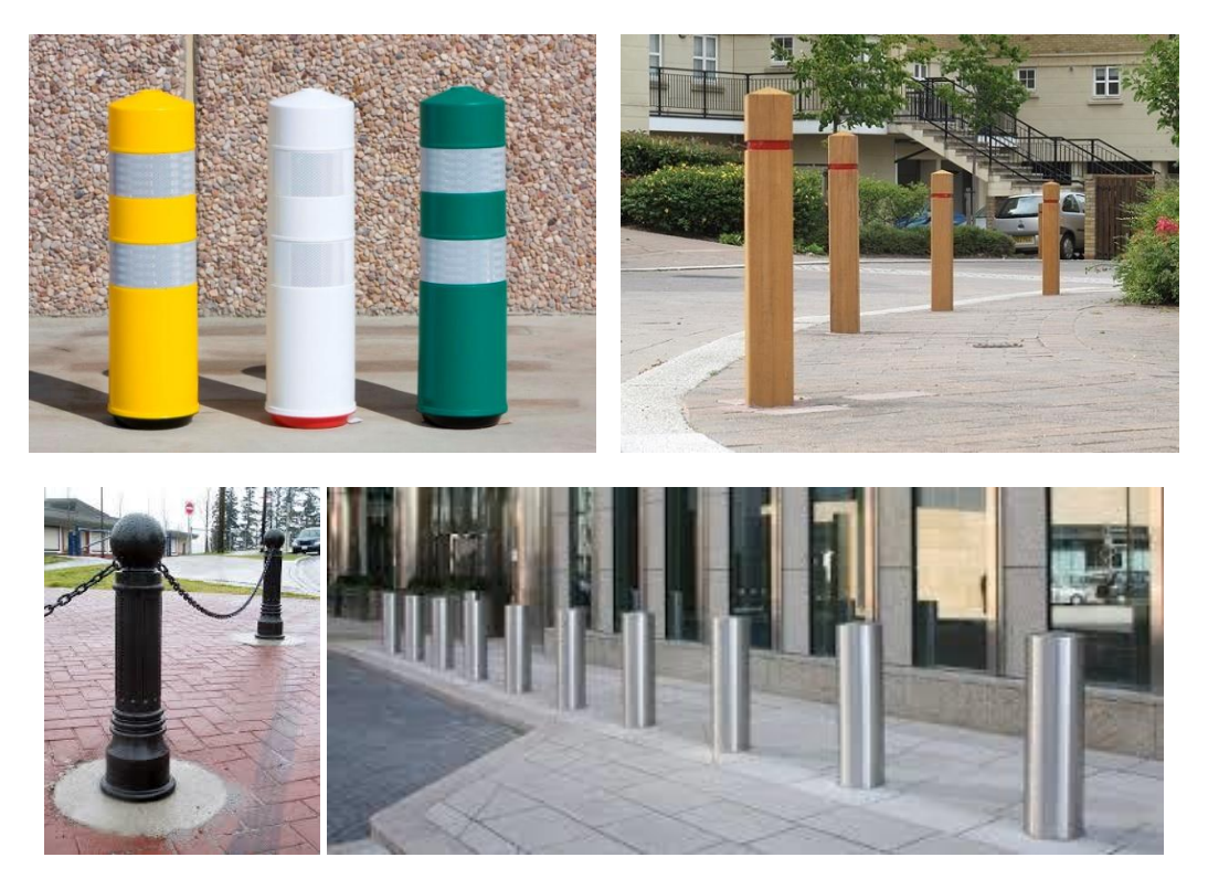
Figure 14. Examples of milestones and bollards.

Figure 14 shows some examples of milestones and bollards that can be found in cities, including different materials, manufacturing processes and designs.