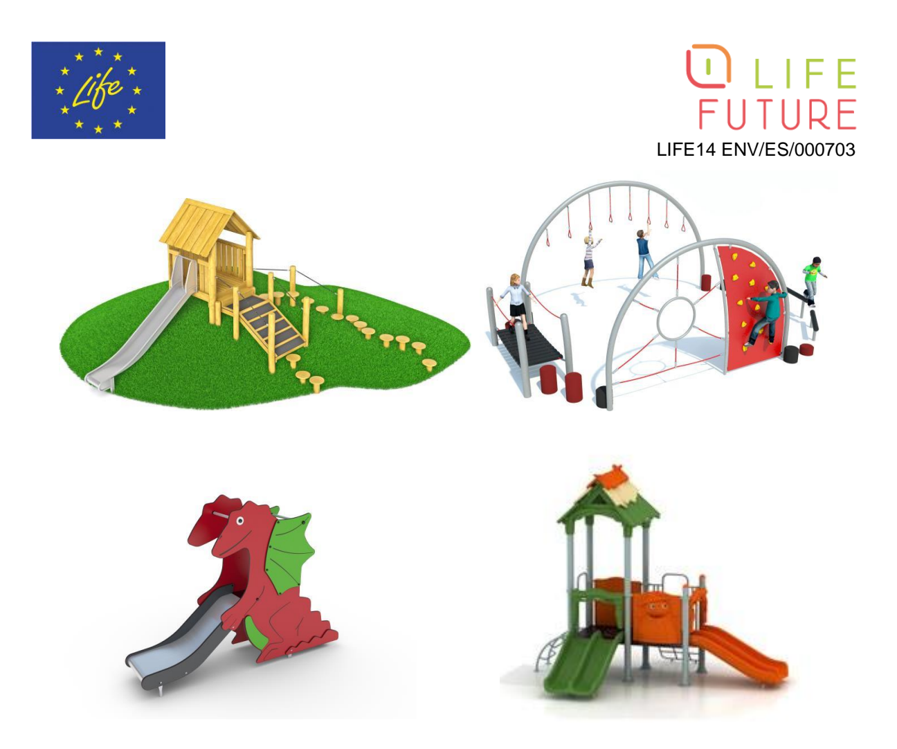
Figure 9. Examples of playgrounds.