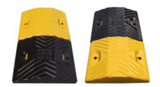
Figure 15. Examples of speed reducers.