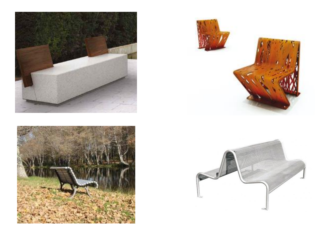
Figure 1. Examples of benches.

Figure 1 shows some examples of benches that can be found in cities, including different materials, manufacturing processes and designs.