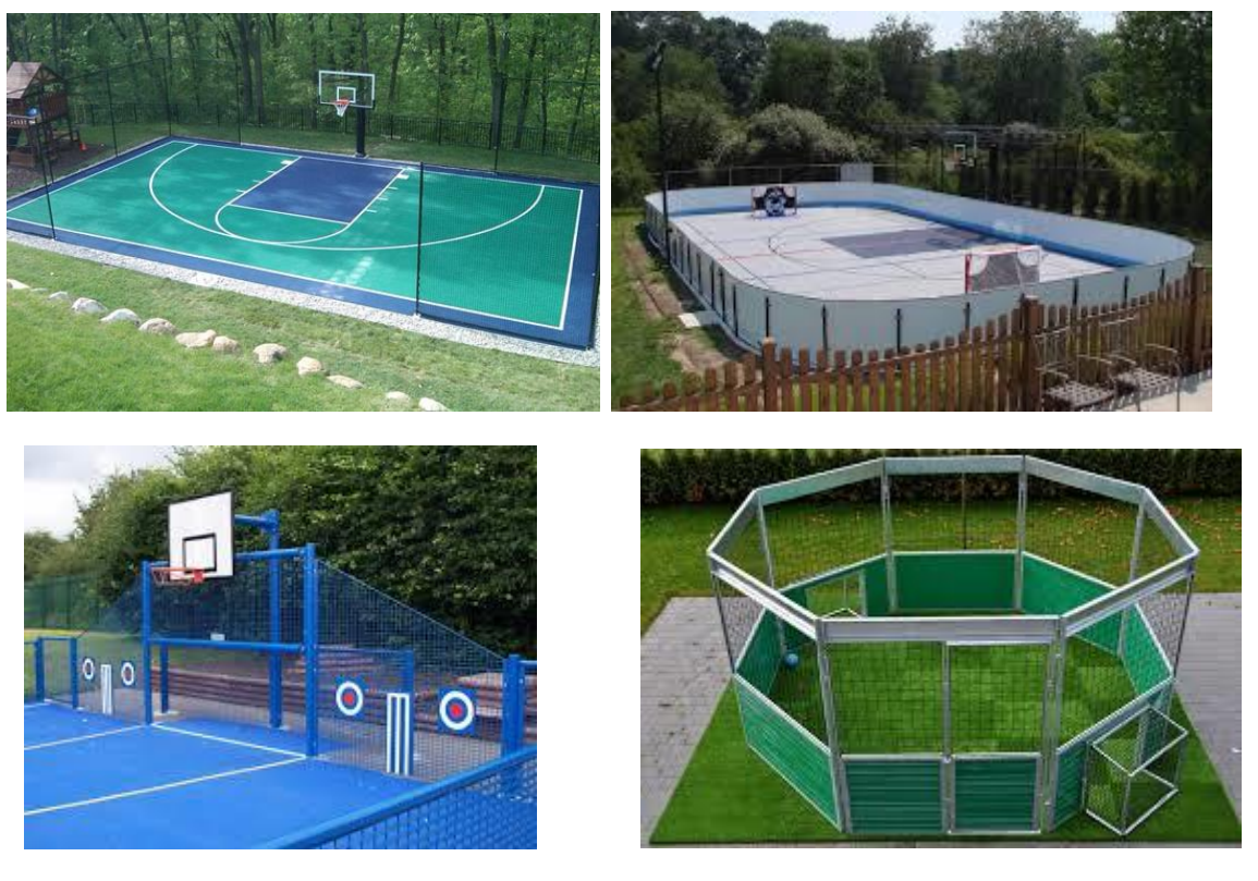
Figure 10. Examples of sports courts.