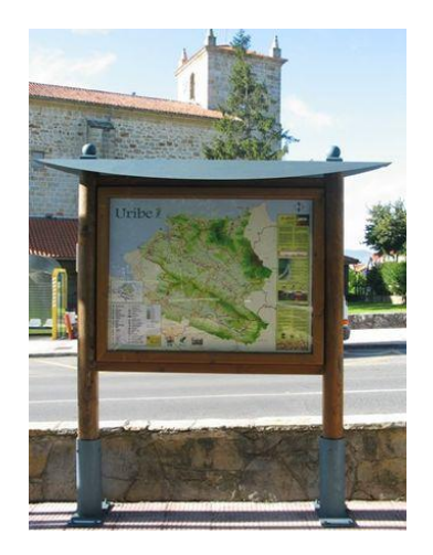
Figure 6. Examples of advertising and information panels.