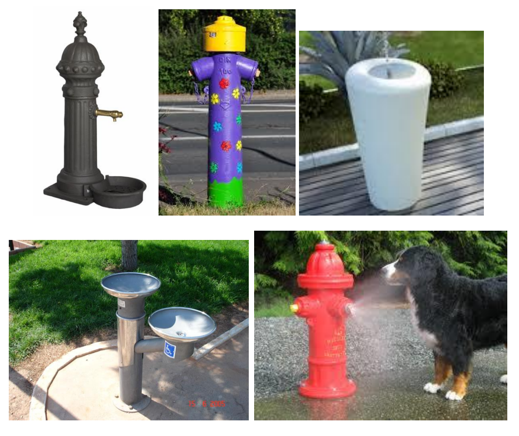
Figure 5. Examples of fountains and hydrants.

Figure 5 shows some examples of fountains and hydrants that can be found in cities, including different materials, manufacturing processes and designs.