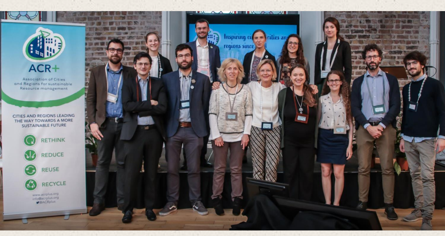
ACR+ Secretariat team at the General Assembly 2019 in Dublin.