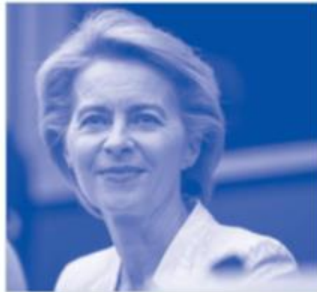
Ms. Ursula von der Leyen President-elect European Commission