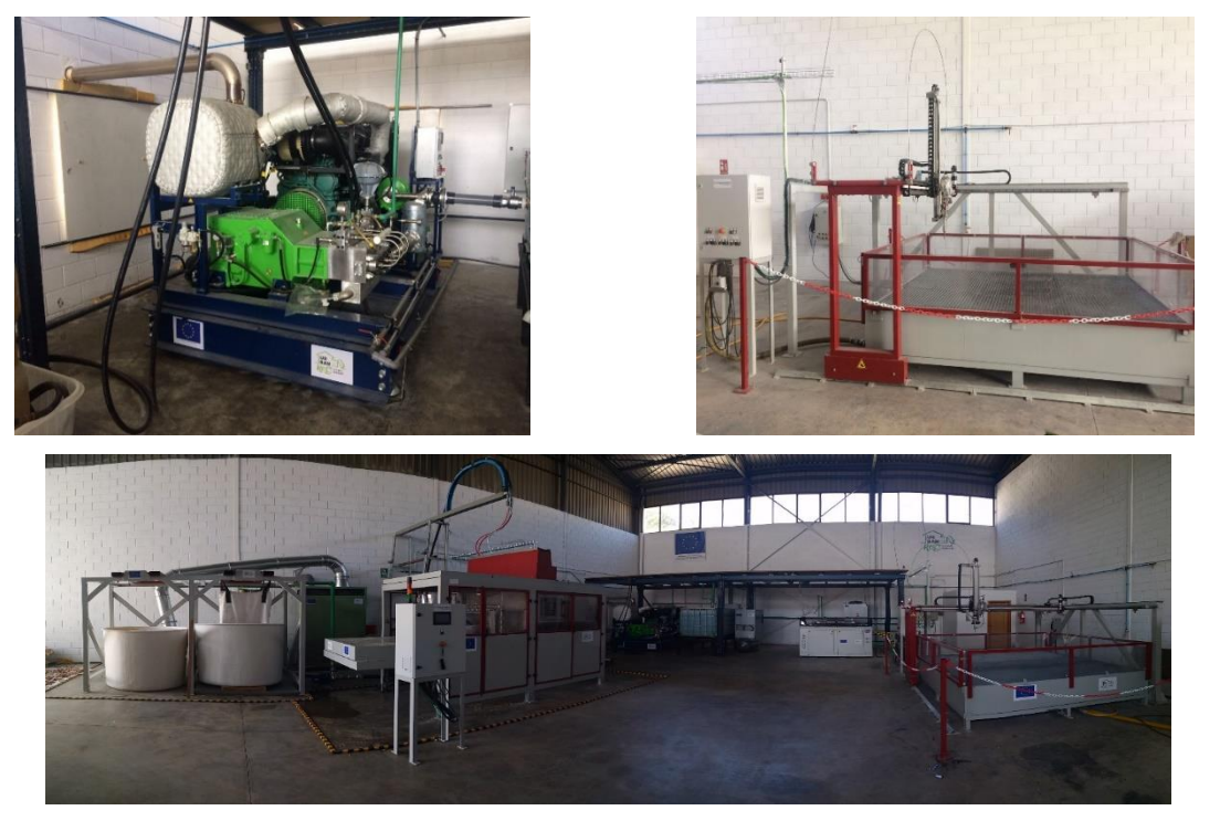
Figure 1 Equipment for laminated cutting technology in the pilot plant

Once the required urban bulky waste is received from the city amenities sites (CA sites), it must be dismantled to reduce its size and to separate their components in different fractions. Dismantling of remaining bulky wastes such as mattresses, furniture, seats, chairs, etc. can generate an interesting large amount of recovered materials such as textiles, foams, metals, plastics or wood. To reduce their size there are different technologies available, that comprise a wide range of machines for preparation of all soft to medium hard, hard, brittle, tough, elastic or fibrous materials.