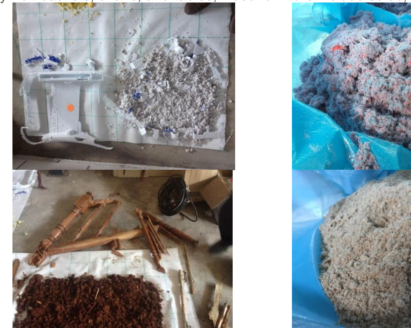
Figure 4. Plastic (up) and Wood(down) furniture before and after fragmentation

Two waste streams have been detected: hard plastic and wood. Hard plastics comprise mainly fruit baskets, chairs, and tables; wood furniture include sofas, chairs and tables.