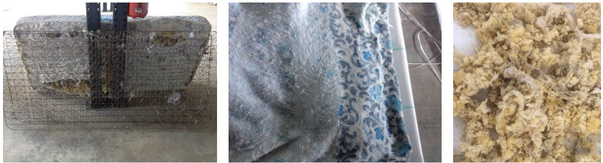
Figure 3. Fragmentation of mattresses: metal parts (springs), textile and foam