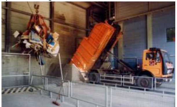
Figure 4: Waste transfer station with a ramp for the unloading of the collection vehicle and an excavator for reloading the waste

Reloading into railroad transporters or ships works principally in the same way like truck-to-truck transfers, except that the transfer station needs to have a connection to the railroad system or waterways. This also applies to the place of final destination. The waste amounts for railroad or ship transports must be relatively large to ensure an economical implementation. Railroad or ship transportation has to deal with a number of logistic and economic limitations and its application in the waste sector is hence rather seldom. To overcome part of these problems special wagons for swap body containers are available for railroad transports. Here, collection vehicles can transfer their swap body directly onto the wagon without further technical means.