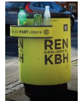
Figure 2: Deposit shelves

Seeing that in 2014 alone, an estimated 166 million DKK [22.29 million EUR] in bottle deposits went unclaimed, the City of Copenhagen initiated a project of installing "deposit shelves" on public rubbish cans in 2015. The idea behind the project was to encourage consumers instead of throwing their empty bottles and cans into a general waste container, to place them in a separate shelf. Thereby making sure that the value of the empty container is not lost and that socially vulnerable groups of consumers living in the city can collect them and claim the deposit. The project thus has both environmental and social aspects 32 . The example of Copenhagen has since been followed by other cities in the country. Notably, Aarhus has installed 70 public waste bins with "deposit shelves" in 2016 33 . Additionally, the initiative was also replicated in Silkeborg, Bornholm, Esbjerg, and possibly other locations in Denmark 34 .