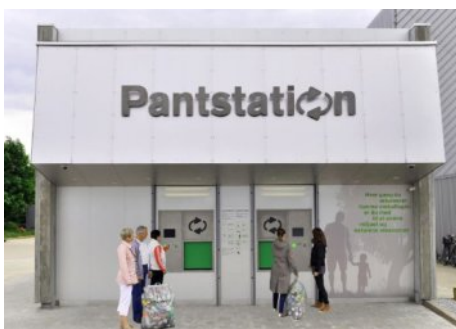
Figure 1: Pantstation

Most commonly consumers can return their empty containers in stores where they are collected manually or via RVMs (95% of collection is done through RVMs).